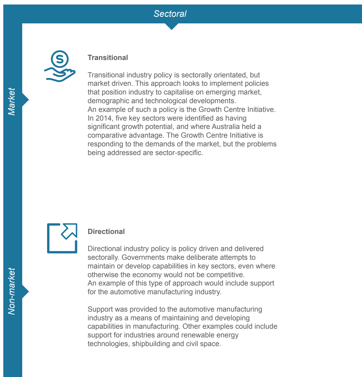
Figure 9.1: A framework for industry policy

Horizontal/activities-based — programmes and policies cut across sectors, targeting factor inputs and market failures. The concern here is more about the general economic environment that businesses operate within. Industry policy is used to promote competitiveness and economic growth broadly — specifically not favouring one sector over another.